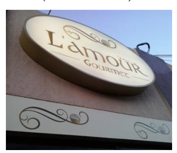
Figure 12: L'amour Gourmet: French candy store (Ourinhos-SP)