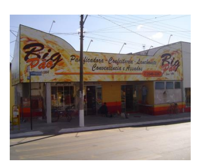
Figure 4: Big Pão: bakery (Ourinhos-SP)