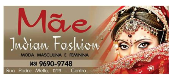
Figure 5 : Mãe Indian Fashion: Indian clothes shop (Jacarezinho-PR)