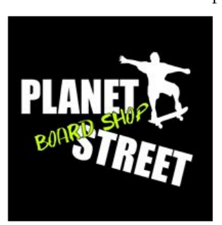
Figure 10: Planet Street: Surf, skate and fitness clothes shop (Jacarezinho-PR)

On figure 10, for example, the name of this store refers to the clothing brand "Planet Girls", being adapted by "Planet Street", with reference to surfing, skating and fitness fashion.