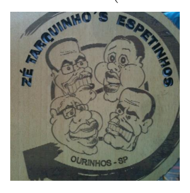
Figure 20 – Zé Tarquinho's Espetinhos: snack bar (Ourinhos-SP)

The picture 20 demonstrates the use of English grammar related to Possessive Case in Portuguese Language and it also shows people want to be connected to the Global Language even if they don't have enough knowledge. It's the power of symbolic forces which makes people relate it to the objectives of mobility.