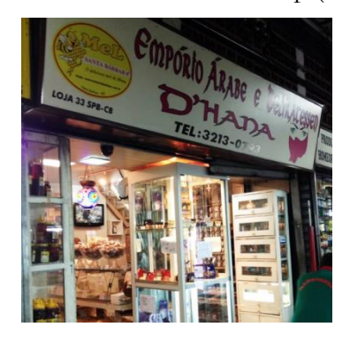
Figure 14: Empório árabe e delicatessen O'hana: Arabic food shop (Ourinhos- SP)